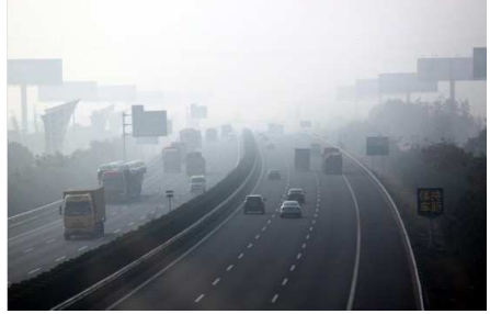
The photo shows the sampling location for validation of the CAS-02 in China