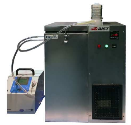
Cryogenic Air Sampler, Model CAS-02

The Cryogenic Air Sampler (Model CAS-02) is a device to collect both gases of high/low boiling points and particle matters in the air simultaneously. It is also designed with a new concept to effectively sample Fluorinated organic toxic substances (such as PFOS, which sets the limitation of collection rate by the conventional methods) and light/temperature sensitive Brominated flame retardant (such as PBDEs) at the same time.